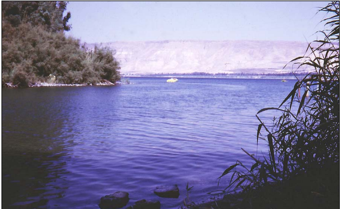
85. Photo 5: The Jordan River and the Sea of Galilee