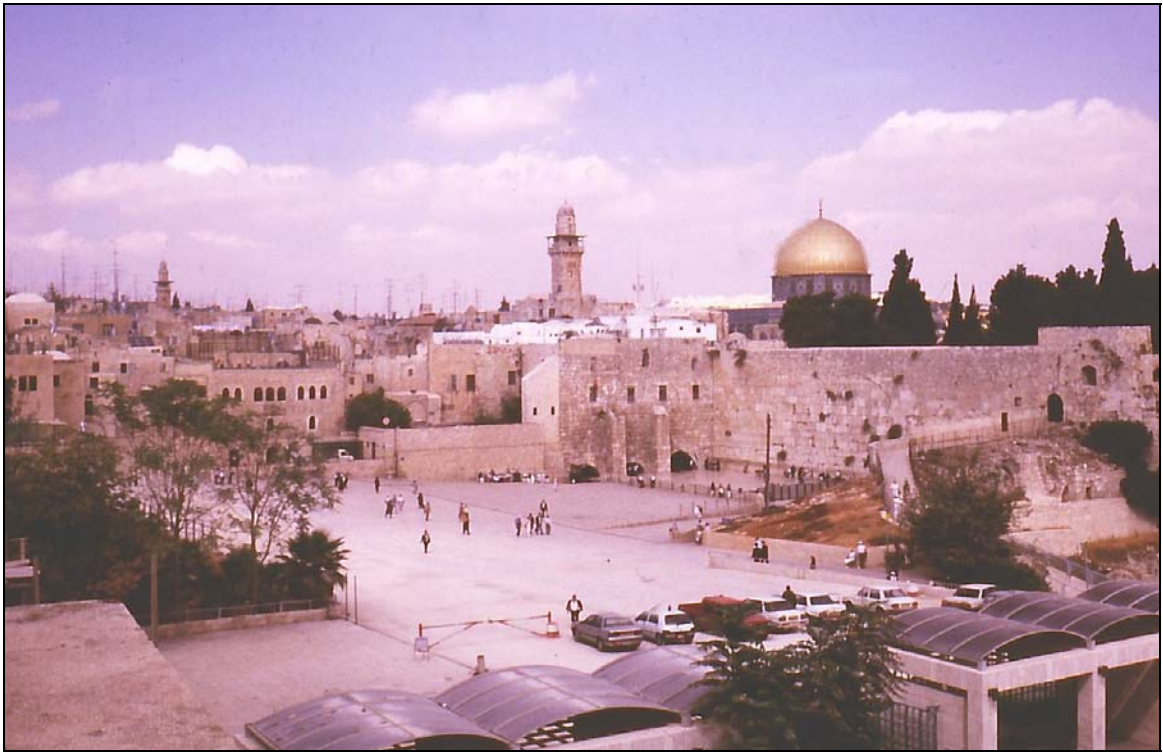
84. Photo 4: Jerusalem