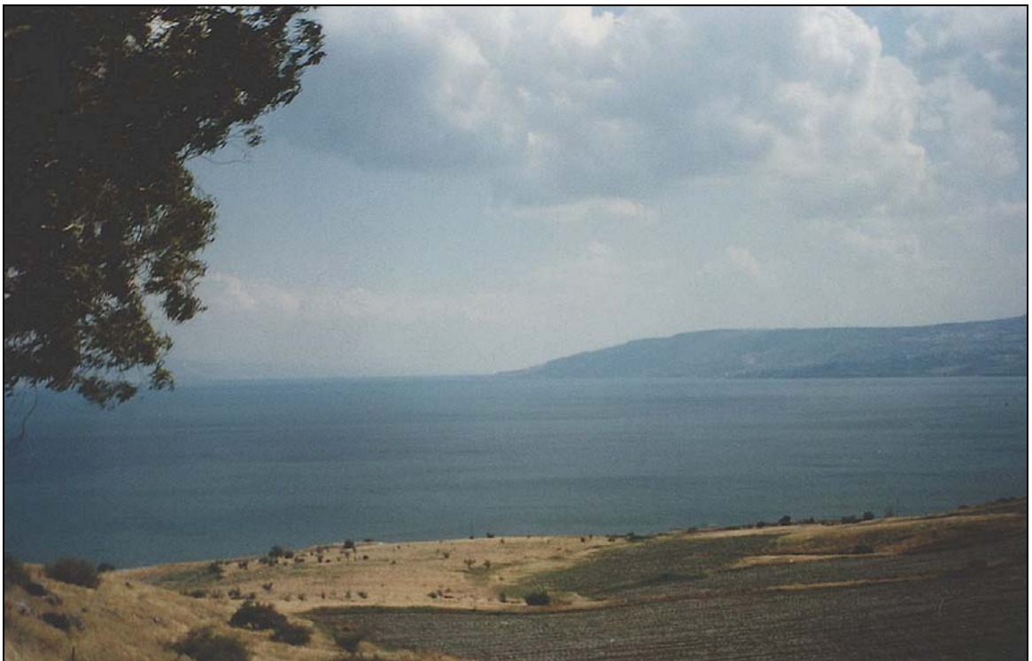
87. Photo 7: The Sea of Galilee