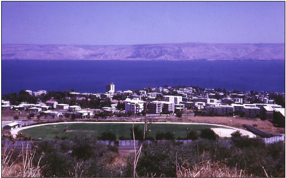
79. Photo 1: Capernaum

80. Photo 1: Capernaum: The Lord Jesus often stayed here by the Sea of Galilee.