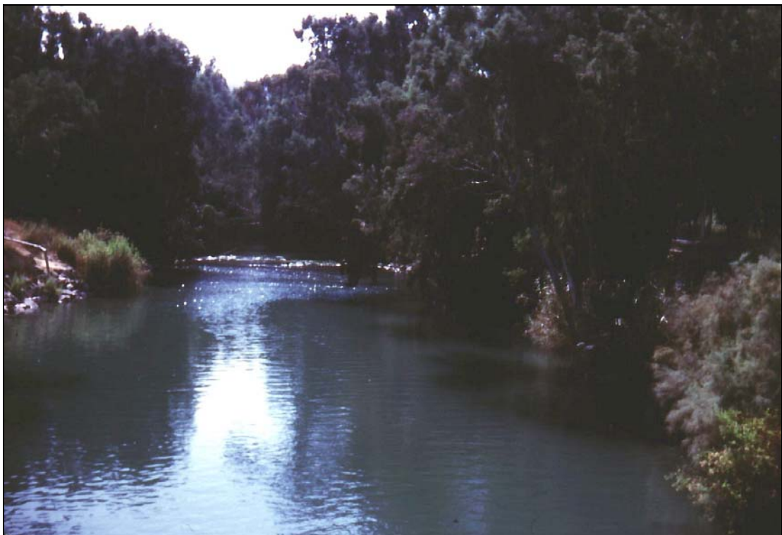
82. Photo 3: The Jordan River

83. Photo 3: The Jordan River: This is the river where John the Baptist baptized the Lord Jesus.