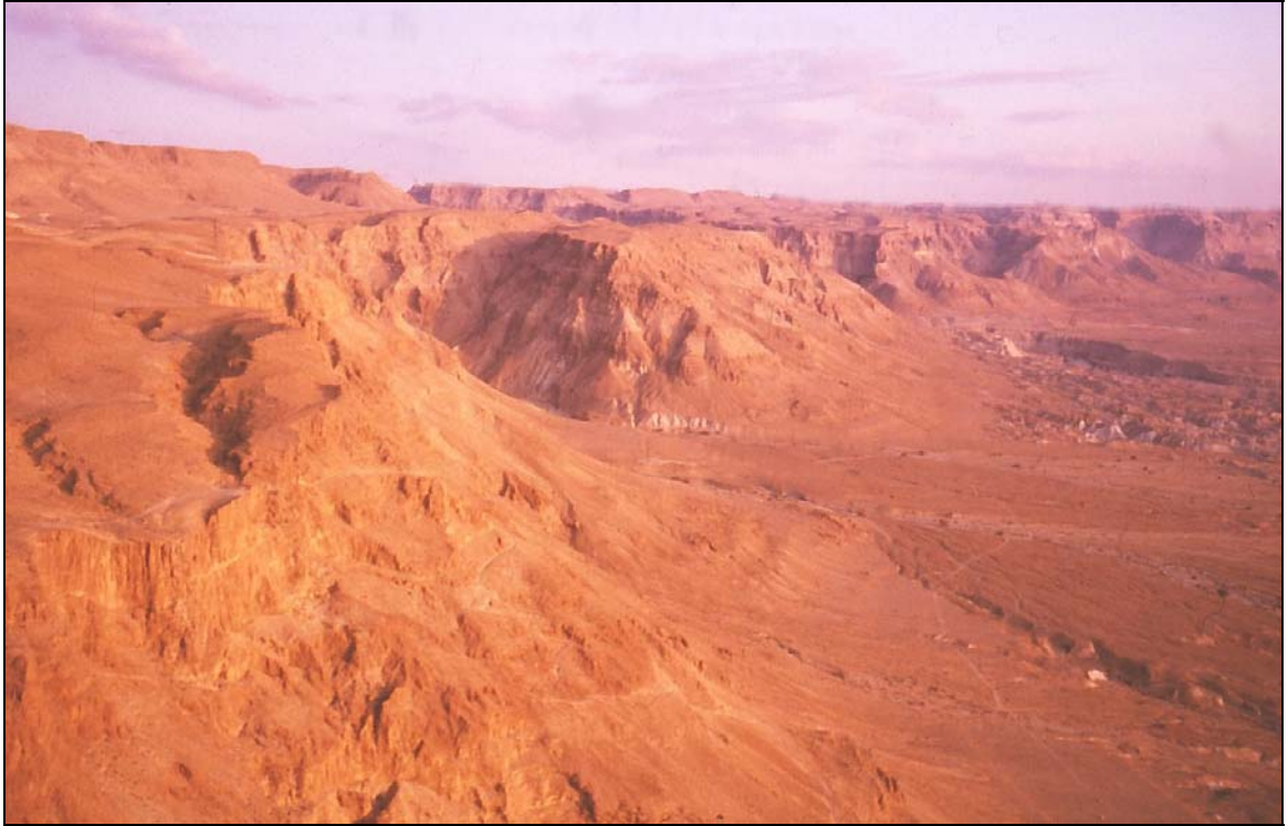
86. Photo 6: Desert Country in Israel