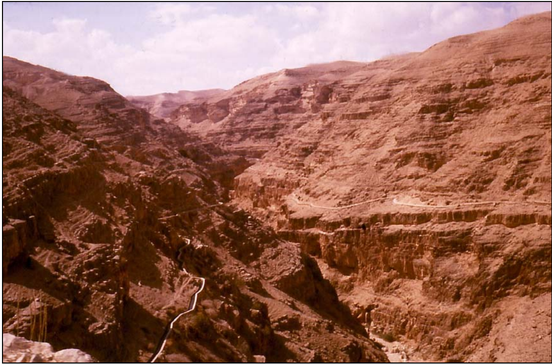
81. Photo 2: The Jericho Road