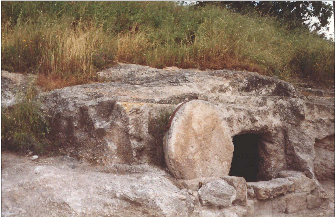
88. Photo 8: A Tomb

89. Photo 8 This photo shows a tomb dug from the rock. The large stone could be rolled in front of the entrance to close it. The body of the Lord Jesus was put into a tomb like this. Three days later, He was raised (see Mark 15:46, 16:3).